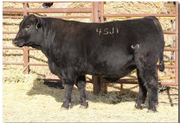
LSS JUDGEMENT DAY 45J1 Sells as Lot 43.