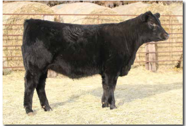
LSS ENCHANTRESS 2189J Sells as Lot 77.