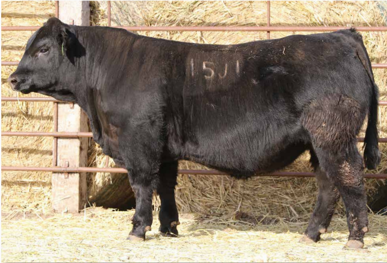
LSS JETFIGHTER 15J1 Sells as Lot 28.