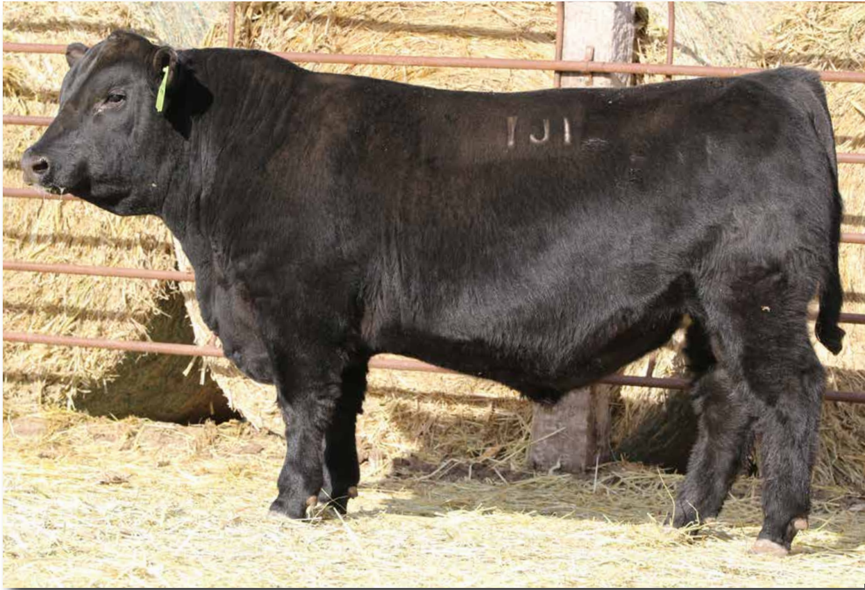
LSS JAEGER 1J1 Sells as Lot 21.