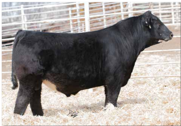
TJ FROSTY 318E Sire of Lot 46

TJ FROSTY 318E sired cattle have stolen the show at both the female and bull sales at Triangle J. They come small, grow fast and have exceptional eye appeal. They are sound structured cattle that are made as good as any percentage cattle in the breed. The baldy cattle are in high demand all around the country.