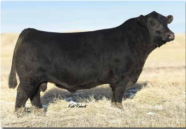
CCR BOULDER 1339A Sire of Lots 32, 33

CCR BOULDER 1339A is a sleep all night long heifer bull and he combines this with top 10% marbling. His cattle come easy and work well on the grid.