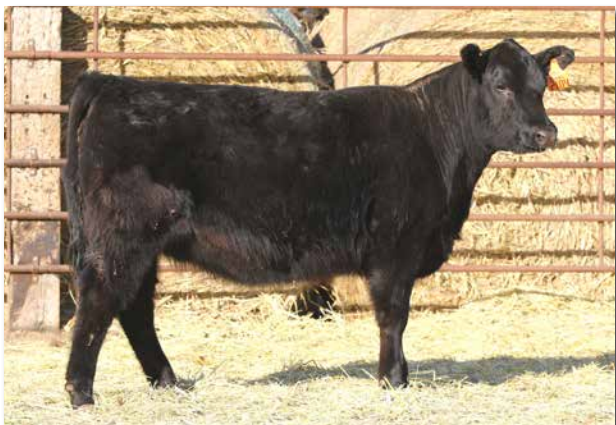
MASON QUEEN 2104 Sells as Lot 51.