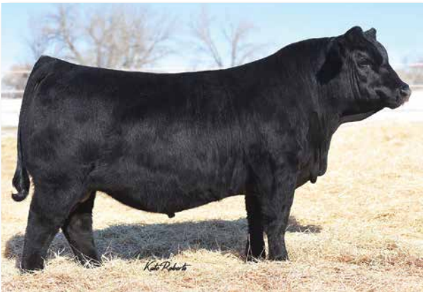
HOOK'S EAGLE 6E Sire of Lots 28-31.

Tremendous power and muscle in this bull.