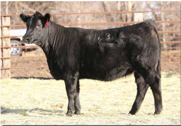
LSS MISS 163J Sells as Lot 71.

Excellent heifer! Tremendous phenotype. Loads of length and muscle with plenty of femininity. Look at her front end, back through her hip. Out of one of our top cows.