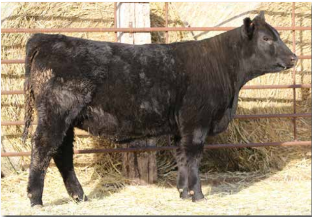
LSS BARBARAMERE 110J Sells as Lot 60.

Can't go wrong with this Eagle daughter. She ranks in the top 15% for API and top 4% for TI.