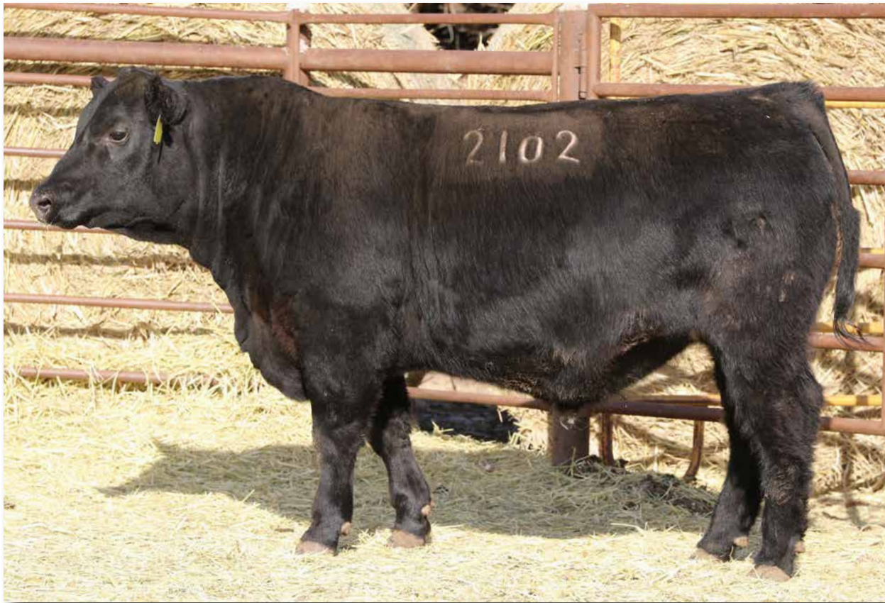
MASON LTM JUSTIFY 2102 Sells as Lot 2.