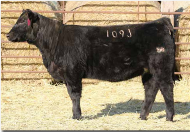
LSS ADA 109J Sells as Lot 59.