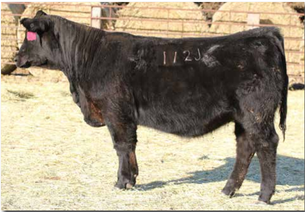
LSS ELBA 112J Sells as Lot 61.

Very well made Franchise daughter. Out of a 9 yr old cow still producing in our herd.