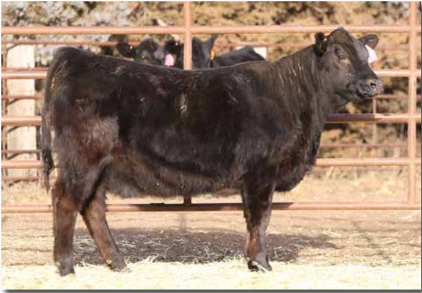
LSS YAZMIN 169J Sells as Lot 81.

81 LSS YAZMIN 169J Black ASA #3984747 Polled 169J 1/4 SM 3/4 AN BD: 3/14/2021 Act. BW 68 Adj. 205