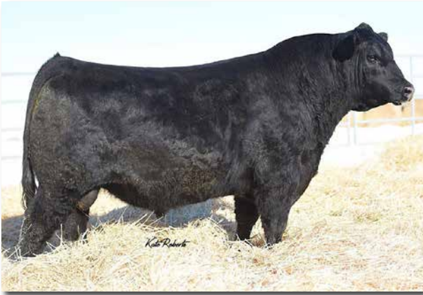
BASIN PAYWEIGHT PLUS 6048 Sire of Lots 8, 9.

BASIN PAYWEIGHT PLUS 6048 is out of the great Basin Payweight 1682 and combines the Lass cow family. He will add pounds, body and ease of fleshing without sacrificing ERTs and maintaining breed leading indexes.