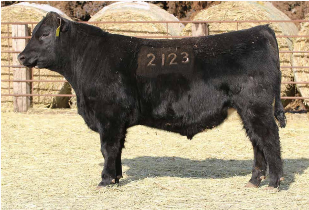
MASON JUSTICE 2123 Sells as Lot 15.