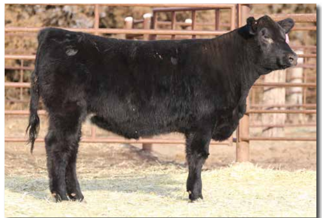
LSS ALEETA 153J Sells as Lot 69.