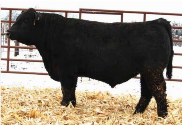
MA FREEDOM F041 Sire of Lots 2-5, 21, 22, 52, 53, 74.

2102 ranks in the top 15% for thirteen different EPDs or $Values, including top 10% for BW, WW, YW, $M, and $B, and in the top 3% for $W and $C. Calving Ease.