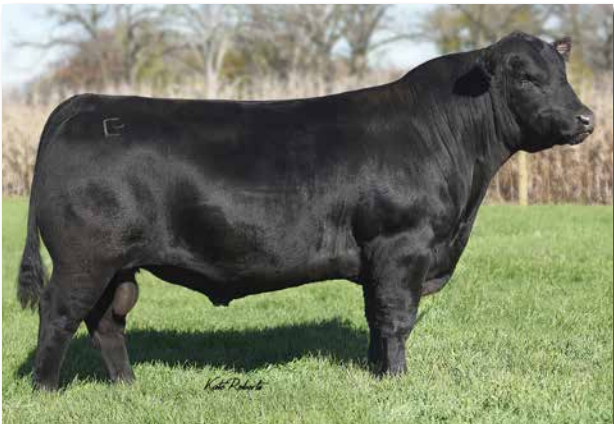
BALDRIDGE BRONC Sire of Lots 6, 7

2110 ranks in the top 15% for eight different EPDs or $Values. 2110's Dam is MA Freedom F041's full sister. Maternal Granddam is a Pathfinder.