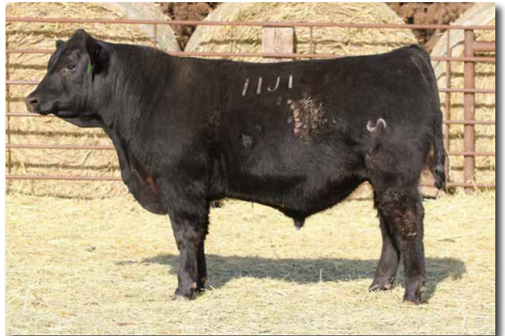
LSS JAMMER 11J1 Sells as Lot 34.