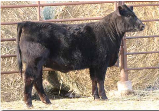
LSS DOLLY 158J Sells as Lot 70.