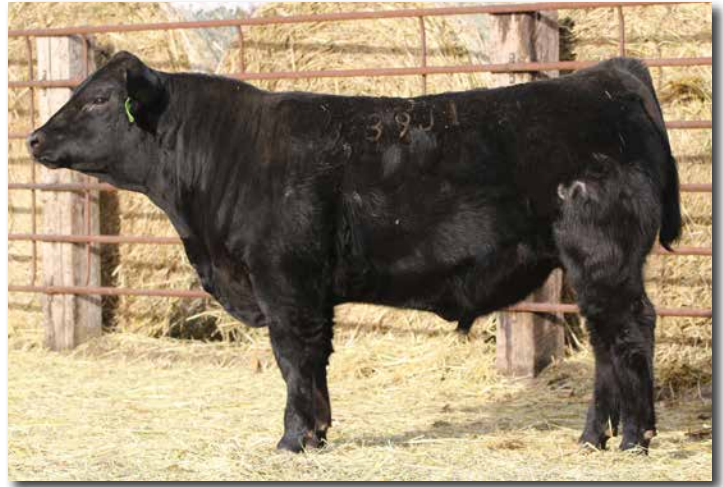
LSS JEWELER 39J1 Sells as Lot 47.