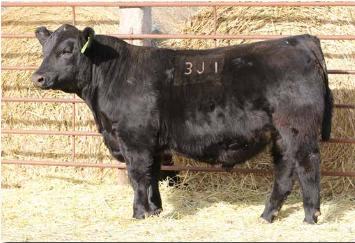
LSS JUROR 3J1 Sells as Lot 32.

CCR BOULDER 1339A is a sleep all night long heifer bull and he combines this with top 10% marbling. His cattle come easy and work well on the grid.