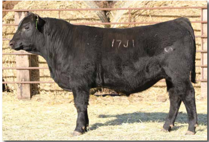
LSS JACKPOT 17J1 Sells as Lot 29.