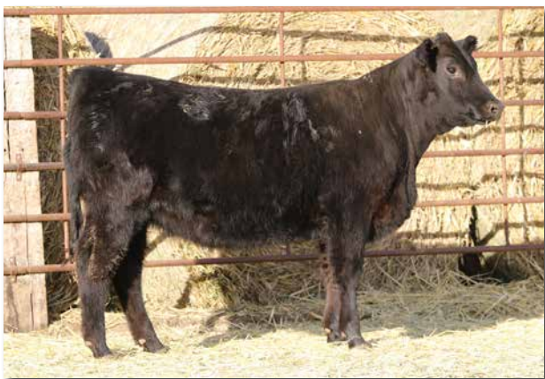
MASON ELLUNA 2174 Sells as Lot 55.

2117 ranks in the top 20% for CED and in the top 30% for WW and YW.