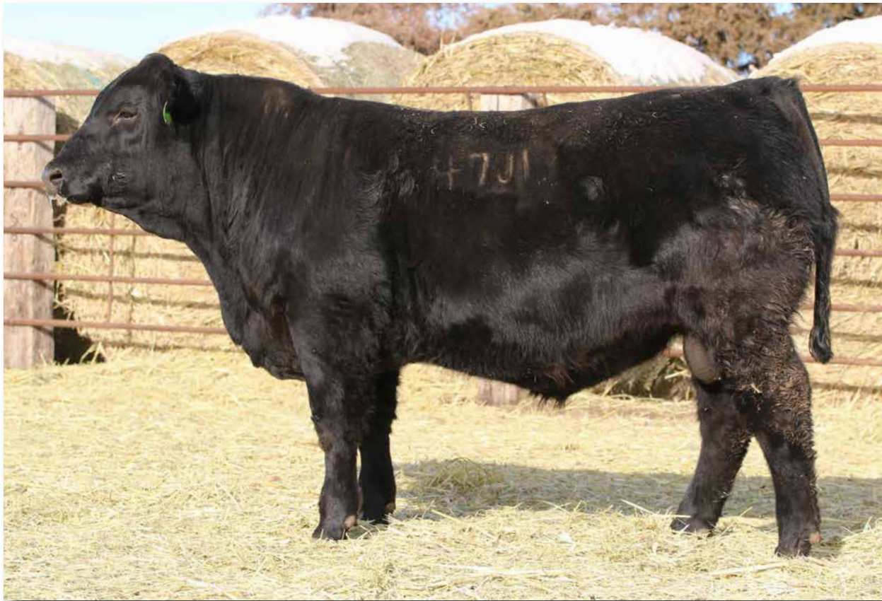
LSS JUNGLE BOY 47J1 Sells as Lot 25.