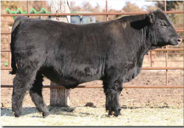
LSS JOKER 10J1 Sells as Lot 39.