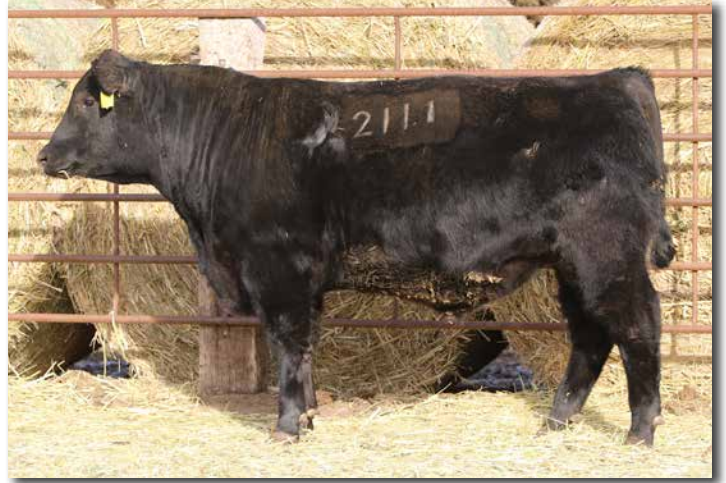
MASON JACKSON 2111 Sells as Lot 7.

2111 ranks in the top 15% for ten different EPDs or $Values, including top 1% for SC and top 2% for $M.