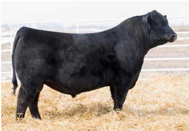
MOGCK ENTICE Sire of Lots 15-18.

2129 ranks in the top 15% for eight different EPDs or $Values, with an elite 2% ranking for Doc and $M.