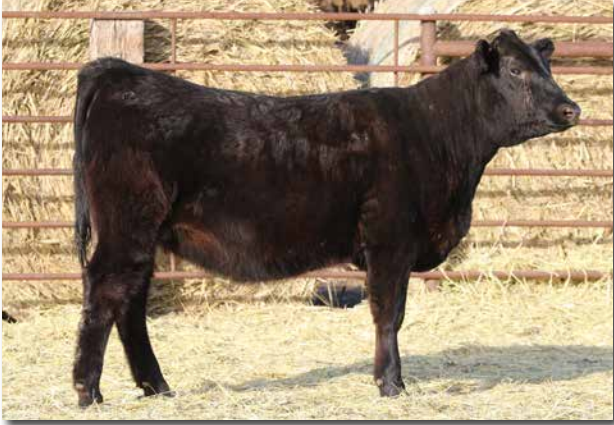
MASON ELGA 2191 Sells as Lot 57.