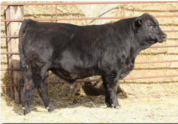
LSS JOURNEY 31J1 Sells as Lot 26.

A bull with great numbers and tons of phenotype.