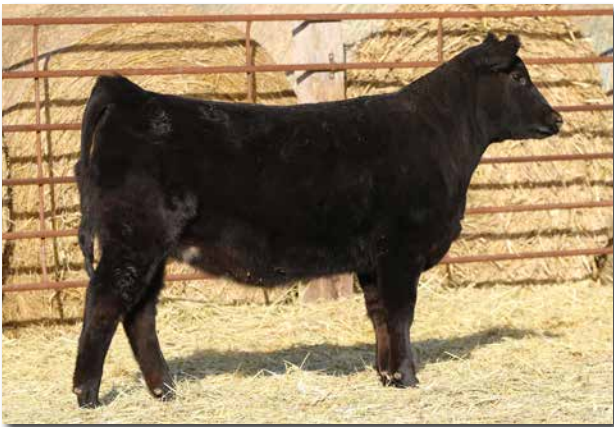
LSS CAMILLE 171J Sells as Lot 73.

Style! Feminine! Muscle! Very good cow family! Longevity!