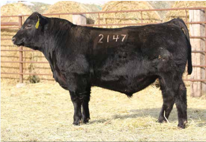
MASON JEDIDIAH 2147 Sells as Lot 8.

BASIN PAYWEIGHT PLUS 6048 is out of the great Basin Payweight 1682 and combines the Lass cow family. He will add pounds, body and ease of fleshing without sacrificing ERTs and maintaining breed leading indexes.