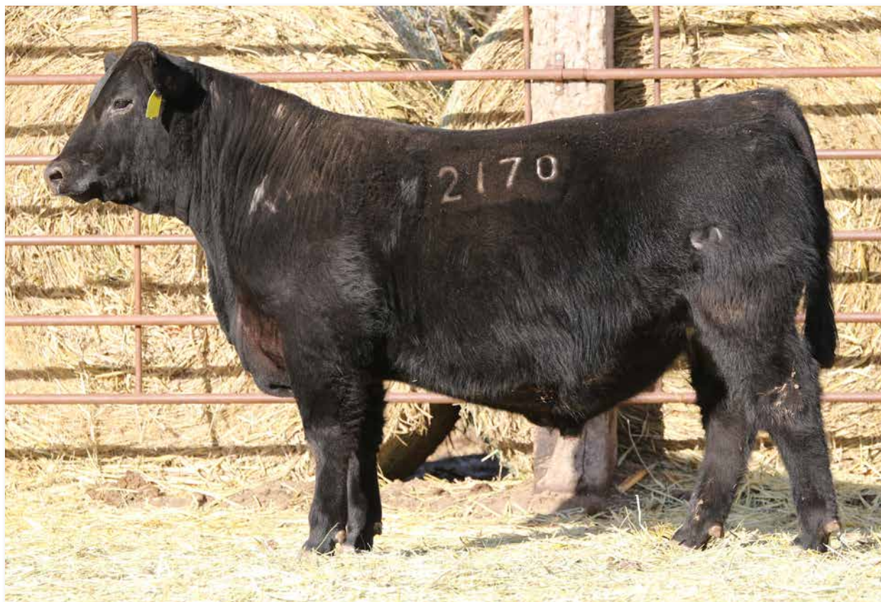
MASON JUGERNAUT 2170 Sells as Lot 19.